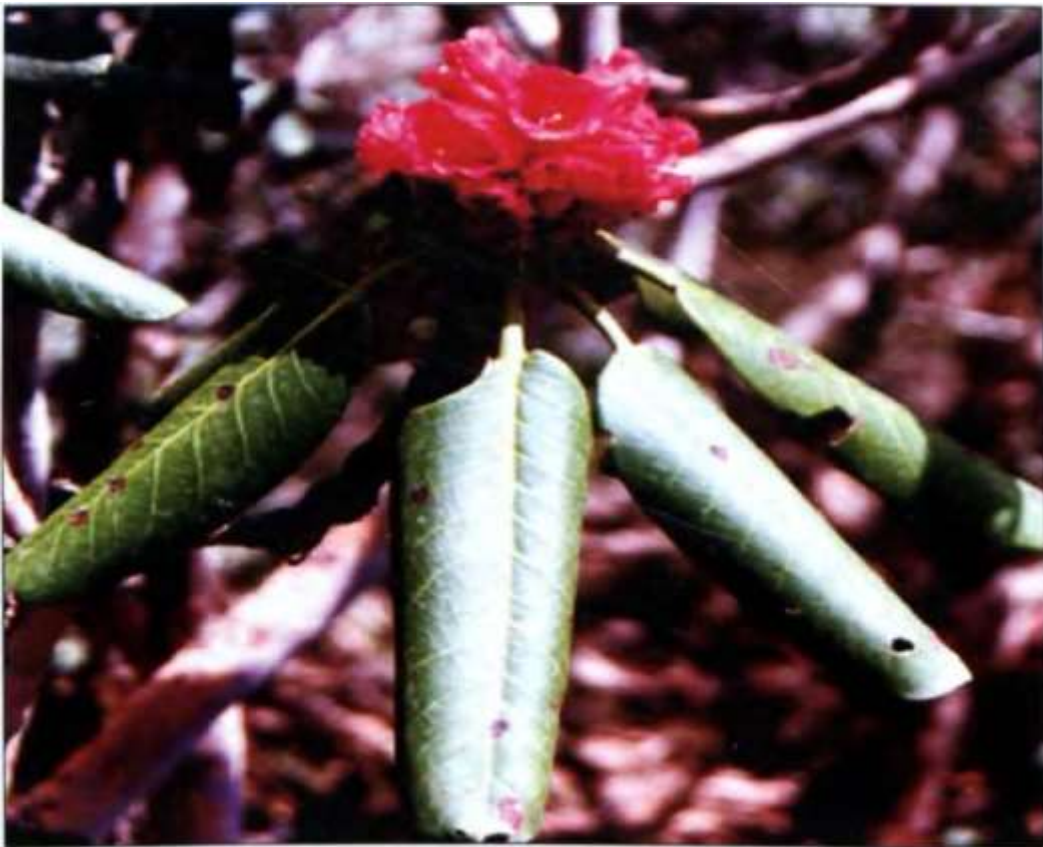
Rhododendron hodgsonii Hook. f.