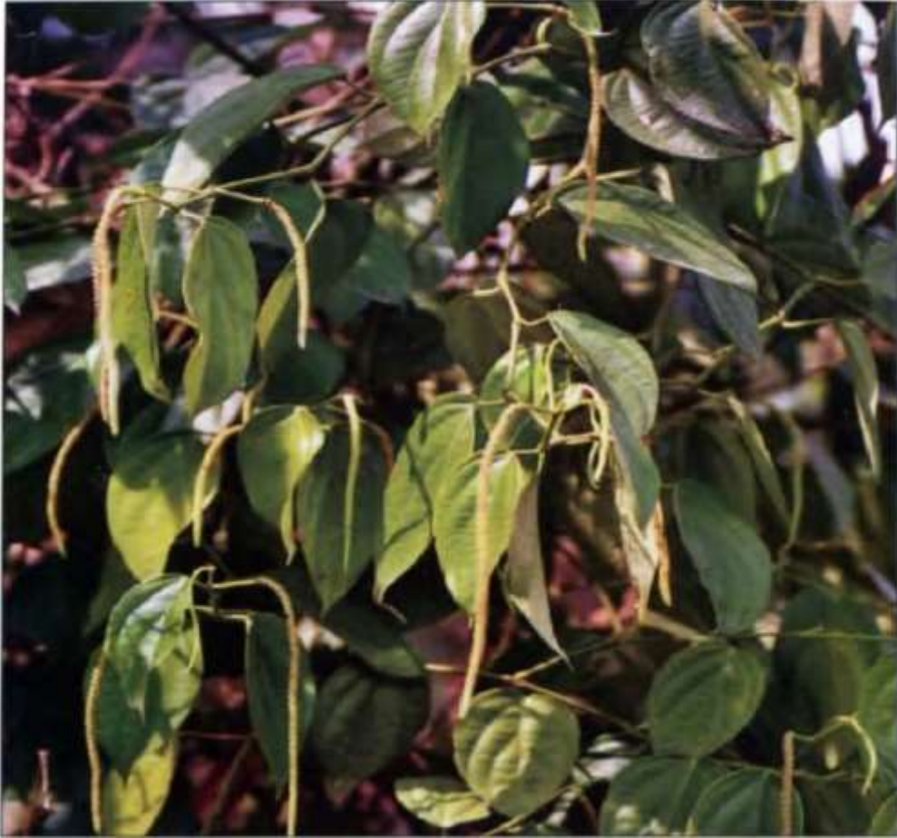
Piper nigrum var. macrostachyum C. DC.