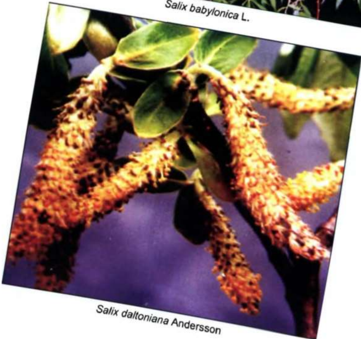
Salix daltoniana Andersson