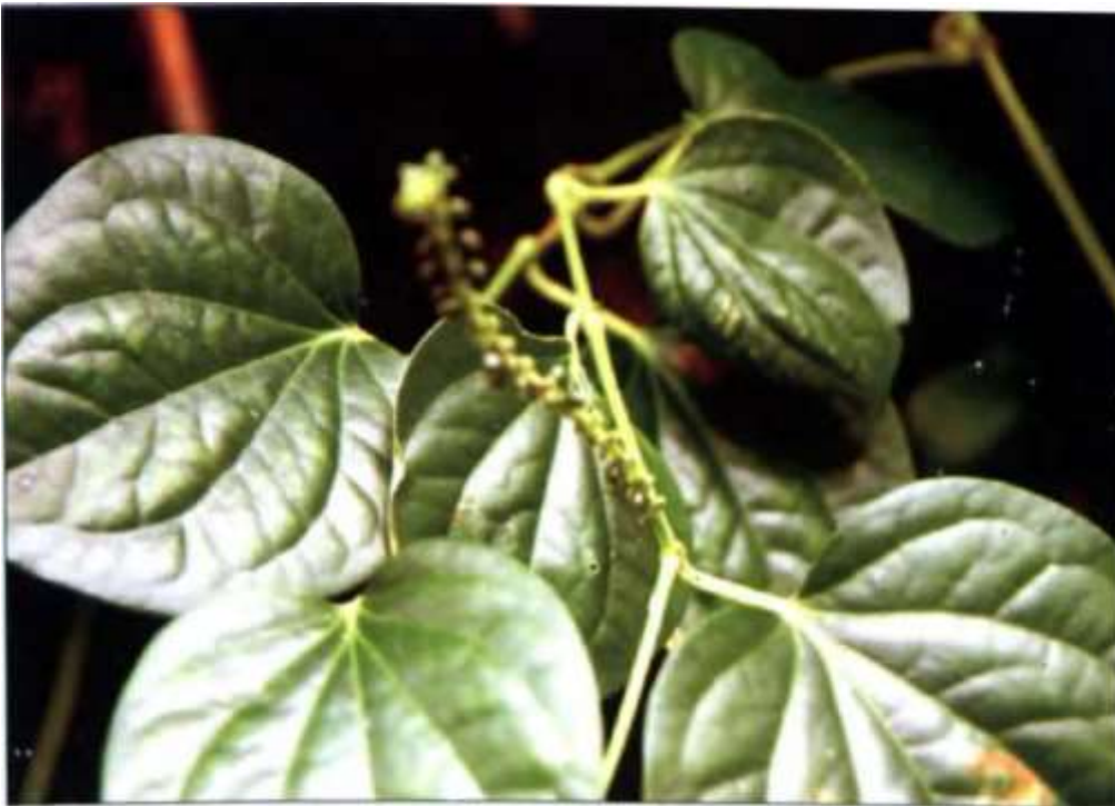
Piper sylvaticum Roxb.