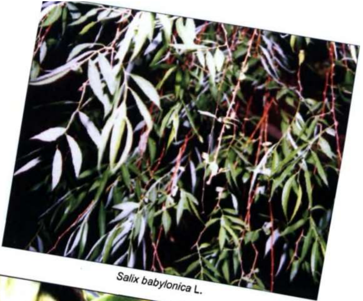
Salix babylonica L.