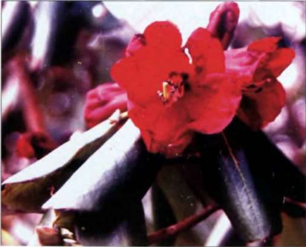
Rhododendron thornsonii Hook. f.