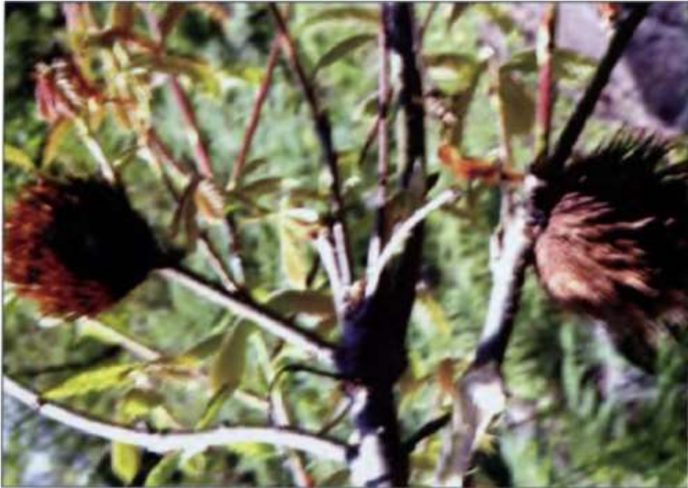
Quercus griffithi Hook. f. et Thomson ex Miq.