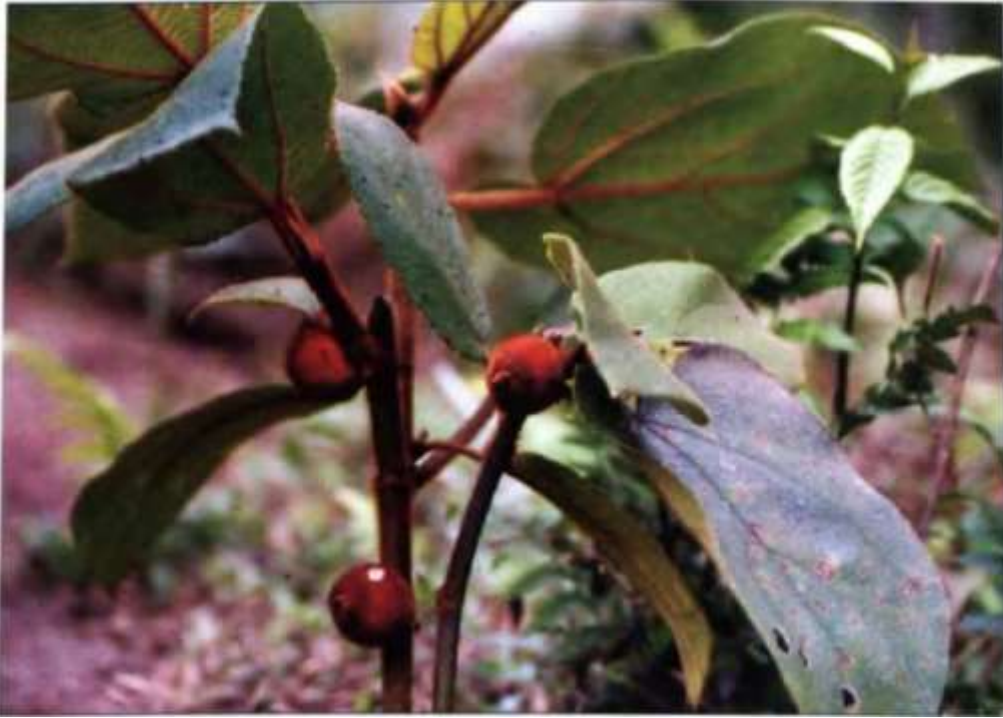
Ficus hida var. roxburghii (Miq.) King