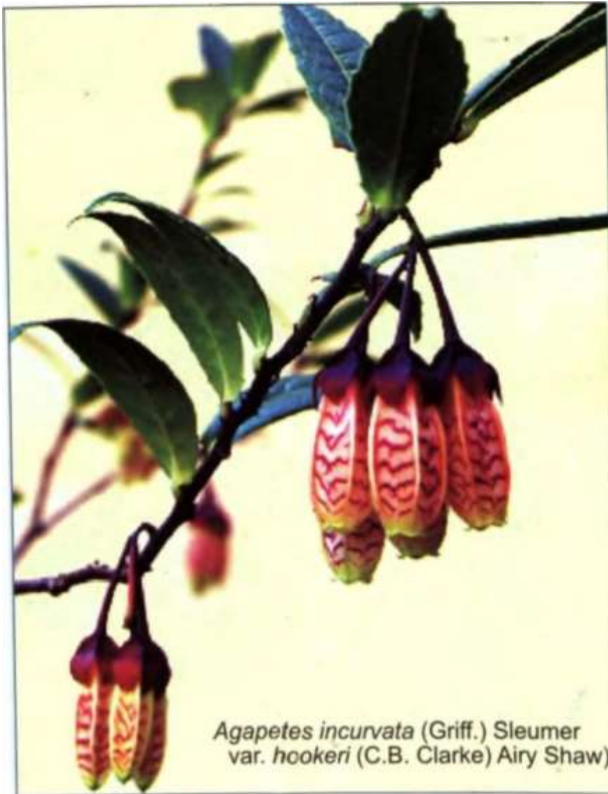
Agapetes incurvata (Griff.) Sleumer var. hookeri (C.B. Clarke) Airy Shaw