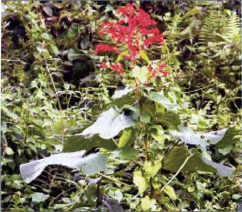
Clerodendrum japonicum (Thunb.) Sweet