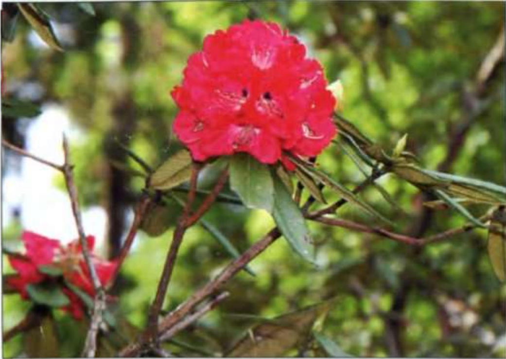
Rhododendron arboreum subsp. delavayi (Franch.) D.E Chamb.