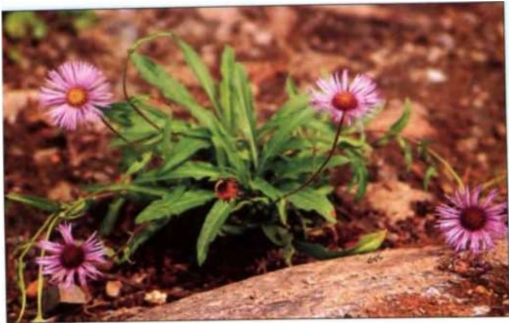
Aster tricephalus C.B. Clarke