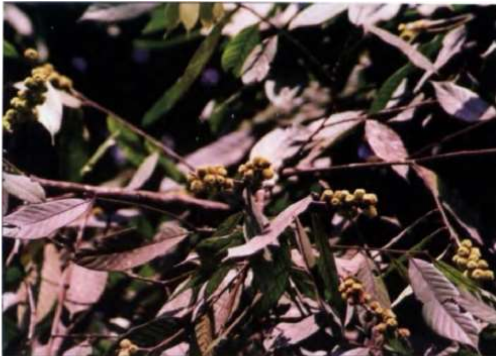
Castanopsis indica (Roxb.) Miq.