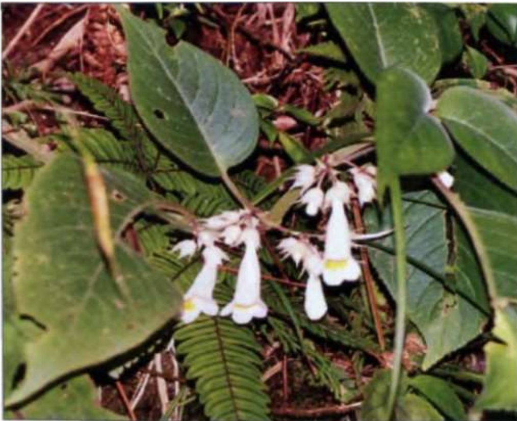
Rhynchosyris obliquum Blume