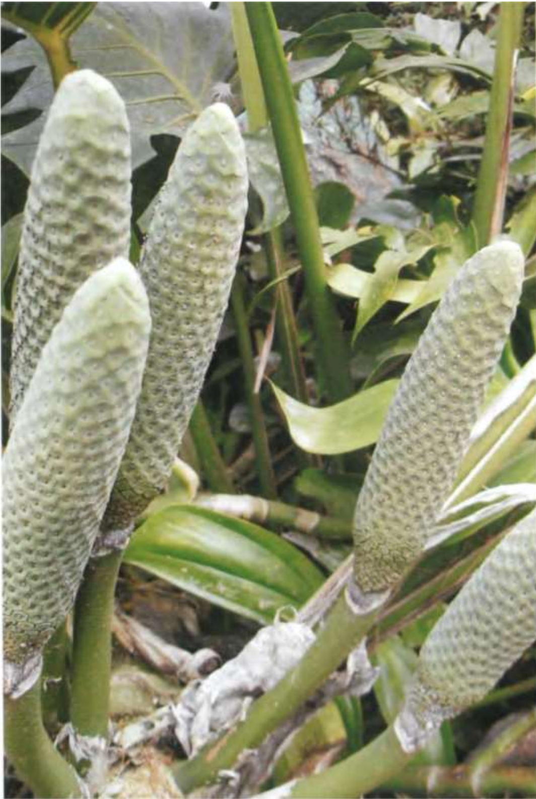
Rhapsidophora glauca (Wall.) Schott