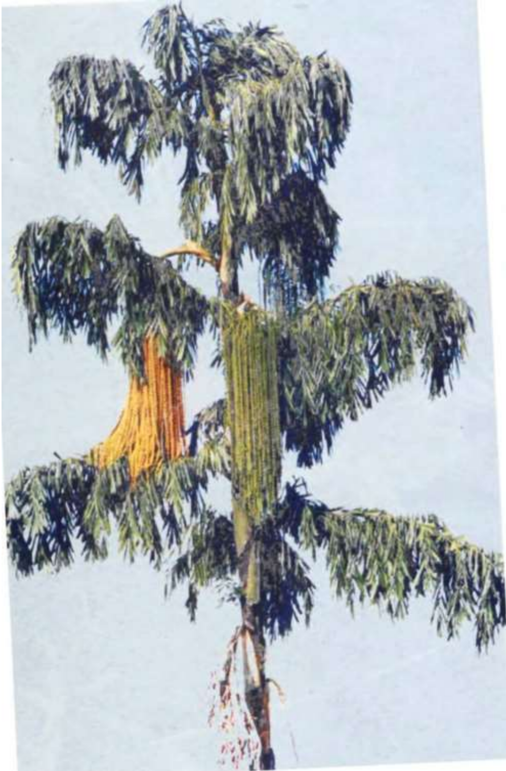
Caryota urens L.