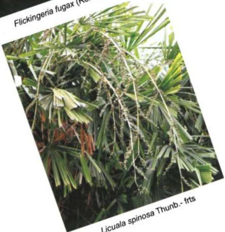
Licuala spinosa Thunb.- frts