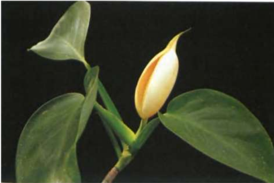
Rhapsidophora decursiva (Roxb.) Schott