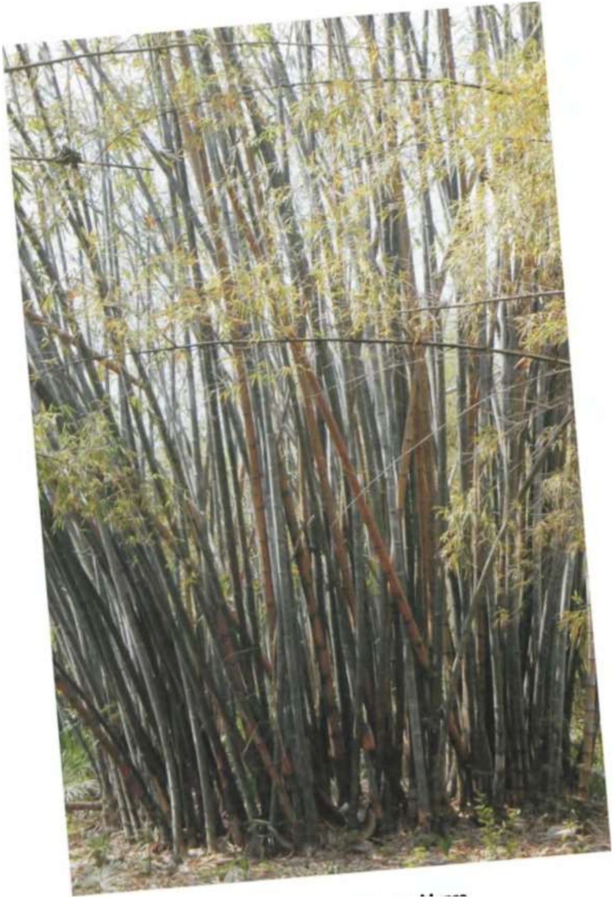
Dendrocalamus giganteus Munro