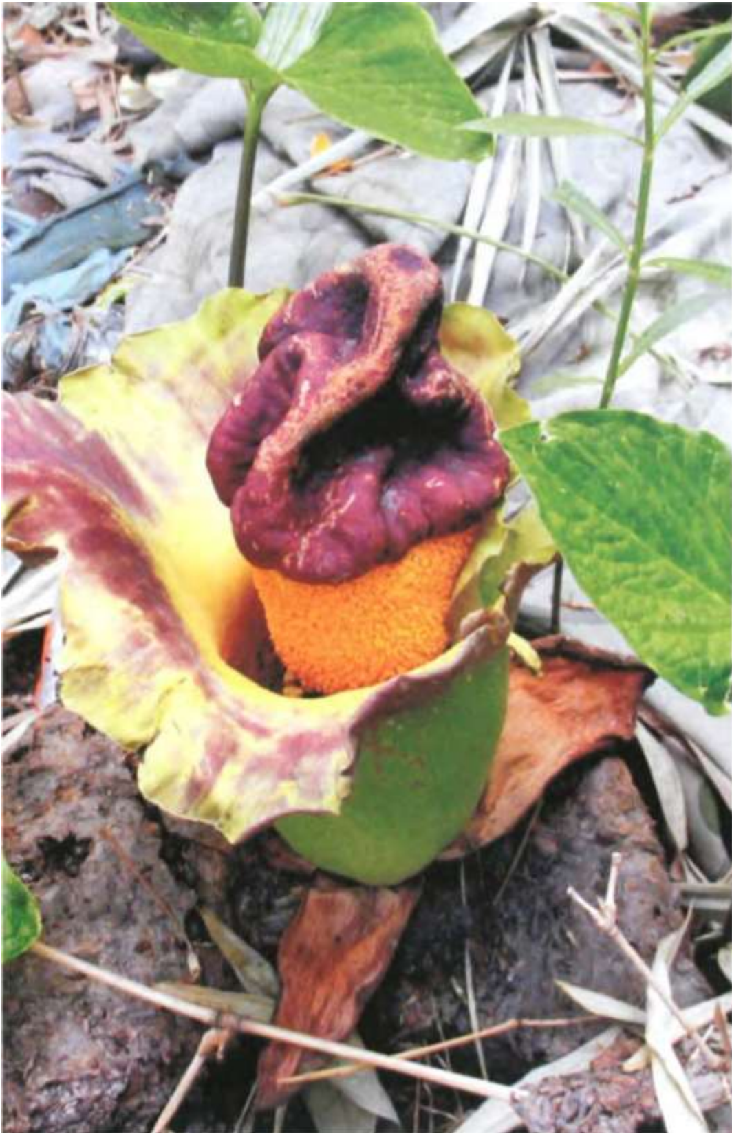
Amorphophallus paenifolius (Dennst.) Nicolson