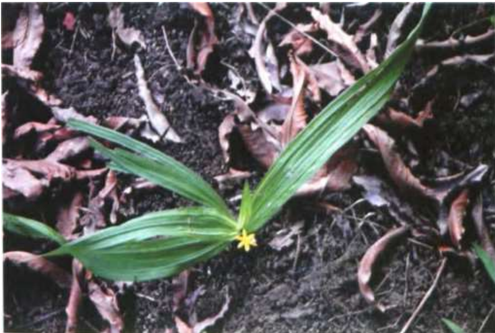
Curculigo orchioides Gaertn.