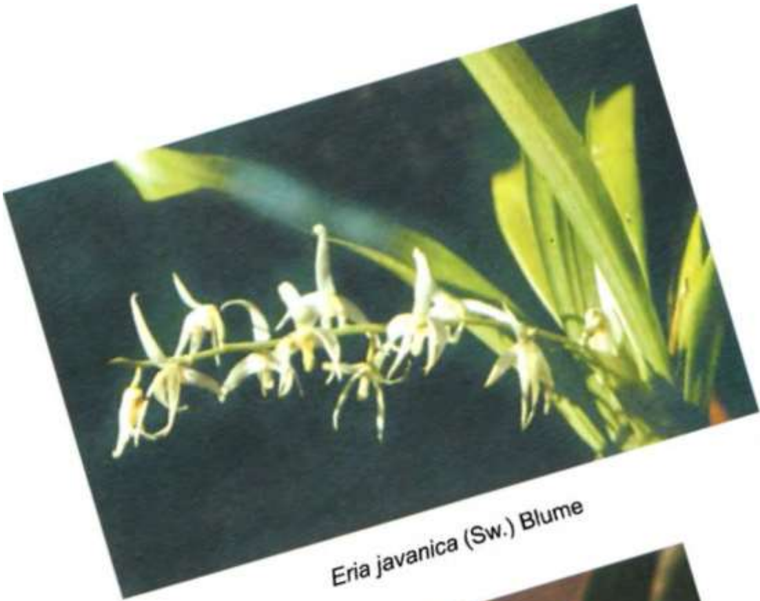
Eria javanica (Sw.) Blume